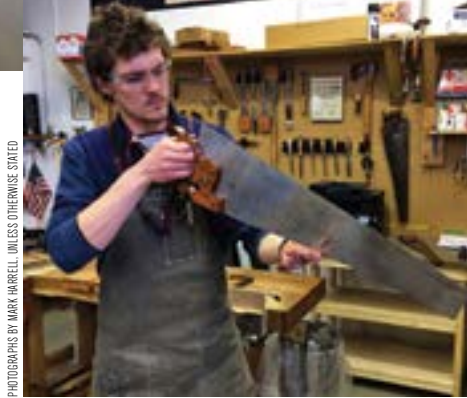
Sighting down the toothline of a handsaw

There are steps you can take now to determine if they're worth putting money into. Let's start with handsaws first. We're going to 'flex-test' the plate – something I do before purchasing any handsaw – to see whether enough life exists in a tool that