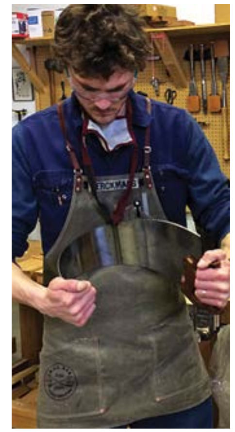
'Flex-testing' a handsaw

In conclusion, flexing a handsaw plate to assess how much tension remains in the spring steel is the key criterion as to whether or not it can or should be saved. As for backsaws, a few simple taps fore and aft will tell you within seconds whether that plate is any good. At the end of the day, horns can be repaired by grafting new wood onto them; plates can be scrubbed rust-free. The most important thing is knowing how to assess the metal sawplate itself before you find yourself throwing good money after bad. REF