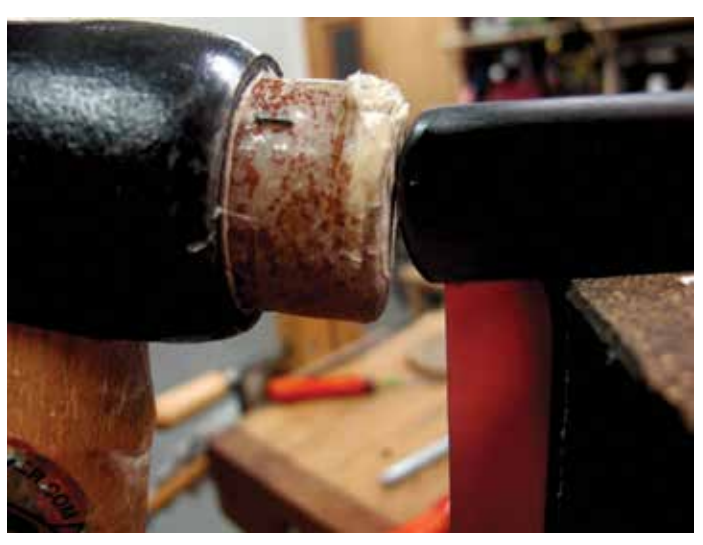
Screw on the handle, mount saw into the jaw extenders and tap sawback towards the back wall of the mortise