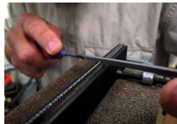
...and sharpen your saw