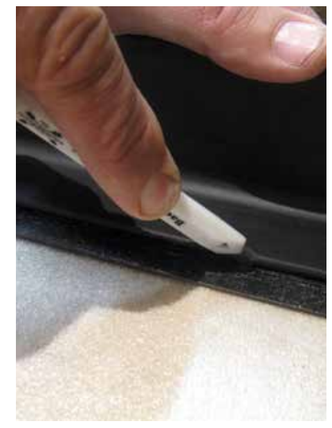
Trim away the waste with a craft knife

Cut the 36in long flat iron piece in half, making two 18in pieces. Use the mill file to deburr all metal edges. Sight down each piece – you'll find that there is a very slight concave side and a convex side. Repeat the same procedure listed above