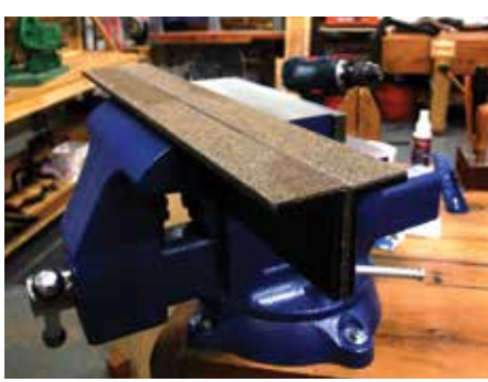
Angle iron jaw extenders for your mechanic's vice

2½in kerf along the middle of one end (use a metal-cutting blade with your jigsaw), line both sides at the kerf end with rubberised cork. Now you have a prybar with which to lift the sawback from a saw you've secured with your angle iron jaw extenders.