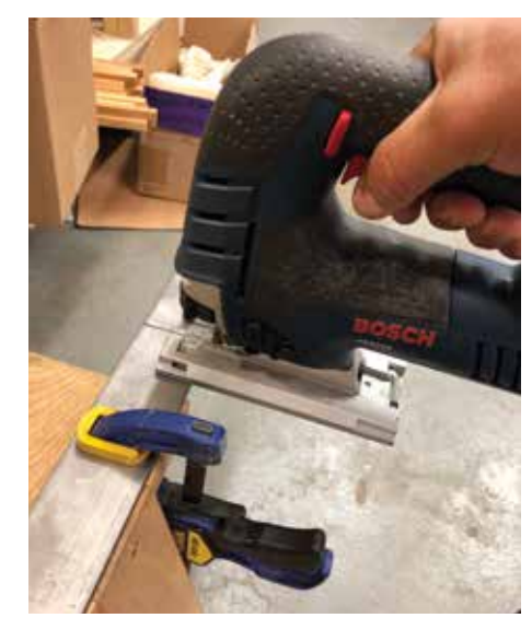
Fit your jigsaw with a metal blade

Using your jigsaw with metal cutting blade, cut a 36in piece of angle iron in half, making two 18in long pieces. Use a mill file to deburr all metal edges. Scrub all metal surfaces thoroughly with emery cloth, followed by coarse then medium sandpaper; go as fine as you want. The intent here is to ensure you strip the works down to bare metal. Put on some surgical gloves (or anything that will keep your fingerprints off the metal) and degrease the metal thoroughly with alcohol until your metal wipes clean. Apply the gunblue or paint treatment of your choice. Allow to cure for 24 hours.