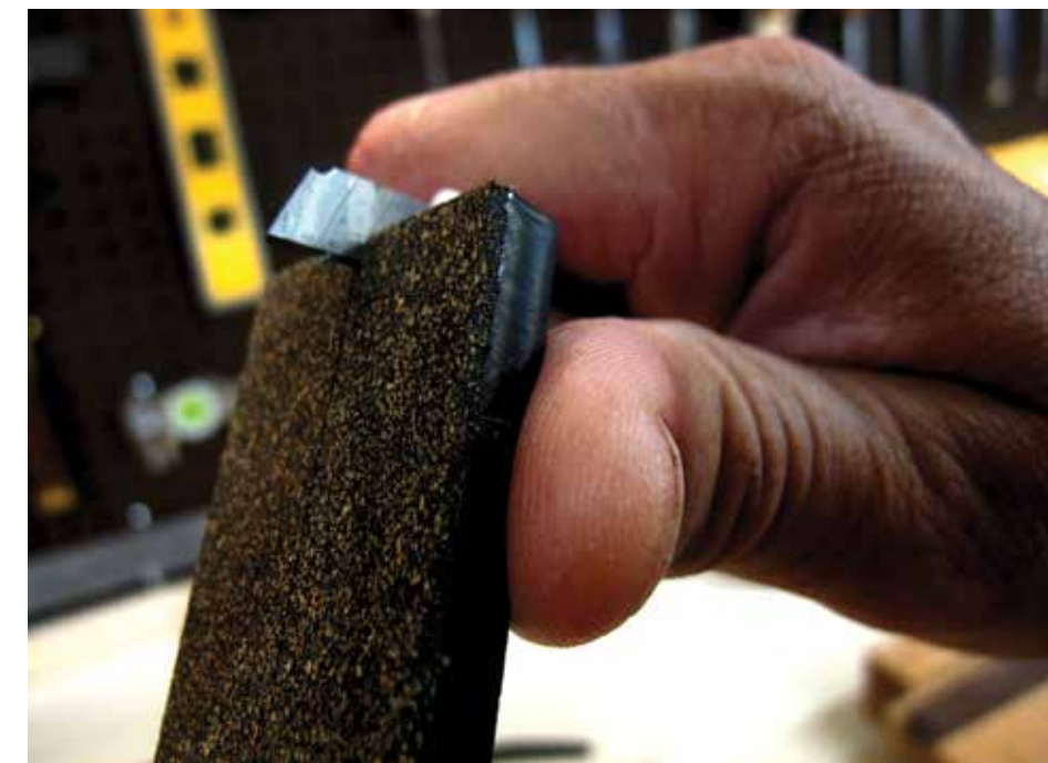
Use a craft knife to open up a slot in the prybar

Cut a 14in length from your 24in flat iron piece for the sawback lifter. Put the remainder aside for future use. Kerf one end on-center for 2½in with your jigsaw equipped with metal-cutting blade. Use emery cloth to sand out the rough edges inside the kerf. Drill a ¼in hang hole on the opposite end ¾in down and on-centre. Use a chainsaw file or your Dremel to deburr the rough edges. Repeat the same steps listed in previous paragraphs to scour your metal clean, blue or paint it. Adhere cork-rubber to both sides of the kerfed area for at least 6in from the kerfed end. Use your craft knife to clear away the kerf and trim all metal edges.