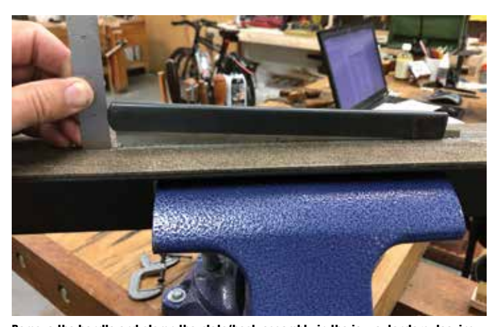
Remove the handle and clamp the plate/back assembly in the jaw extenders, leaving ½in clearance at the toe with the heel making positive contact on the surface of the jaw extenders