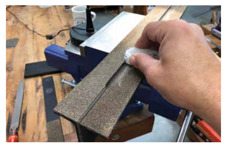
Flip the plate spine up into the jaw extenders and lubricate the exposed %in of spine with some canning wax. Tap the toe end of the sawback onto the lead corner of the plate