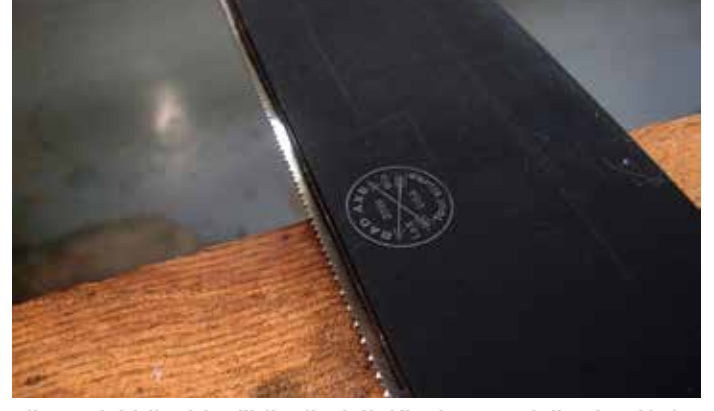
...then sandwich the plate with the other half of the vice; secure both ends and inchdown with c-clamps