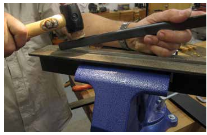
Tap the sawback onto the spine of your plate with a stout mallet and begin rotating the sawback down, tapping as you go to get the sawback to grab