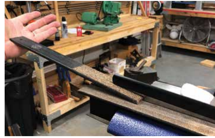
Slide your sawback lifter underneath the toe end as far as it will go. Then lift upwards. Do NOT fulcrum the lifter down, or else you'll gouge the underside of the sawback