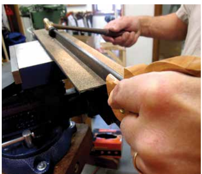
Gently tap the folded back towards the handle to close up any gaps

lined with rubberised cork, with which you can sandwich a sawplate in place with about 1/8 in of exposed teeth and gullets just over the top. Clamp the ends to hold it together as a unit, then insert the assembly in-between the angle iron jaw extenders explained above and cinch the works tight with your mechanic's vice. Now you have a rigid, rocksolid and vibration-free sharpening solution. For smaller saws, you can simply put the unit in a woodworking face vice to fix it in place. It's super-easy sharpening both sides of your toothline: just flip the unit around in your angle iron or woodworking face vice with no careful readjustments required like you normally have to make with a standalone saw vice. Though set-up takes longer than a standalone saw vice, you'll come to prize the vibration-free aspect of sharpening which also adds life to your saw files (which tend to degrade faster with vibration during the sharpening process).