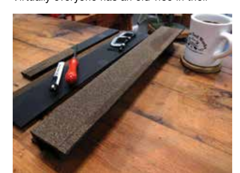
When broken down the kit is easily stored

workshop likely gathering dust. You can quite easily extend its jaws with angle iron and secure within those extended jaws a sawplate for sharpening with two 18in lengths of flat iron. Line all the clamping surfaces with rubberised cork, and you wind up with a vibration-free, and incredibly tight workholding system that allows you not only to sharpen a saw but perform various other backsaw maintenance tasks with ease. When you're done with it, simply stack the components and move them out of the way.