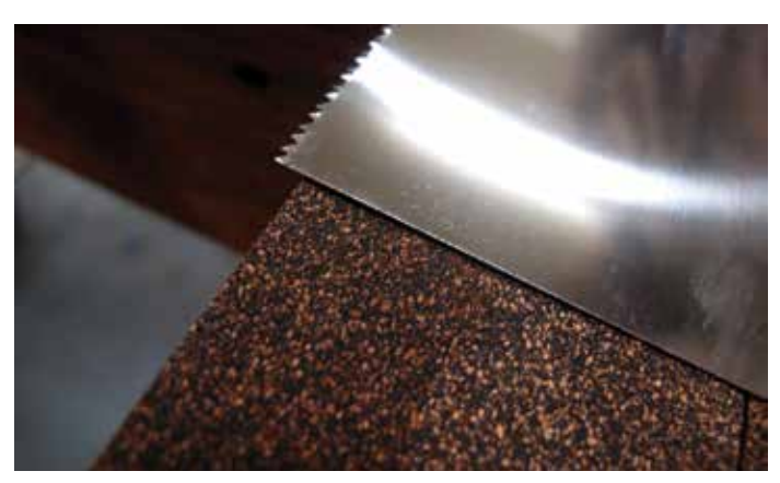
Once you've peeled off your sawback, remove the plate from the jaw extenders and lay it (teeth up) on one of the saw vice pieces with 1/6 in to 1/16 in of the toothline exposed