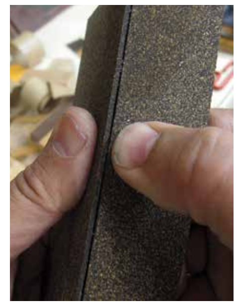
Press the edges of the rubberised cork tightly together

Wipe down the painted or gun-blued surface again with alcohol to thoroughly de-grease any remaining residue. Apply the cork-rubber to the angle iron, completely covering the top surfaces and inside surfaces as shown. Cork-rubber with an adhesive strip surface is fast and convenient, but I've also found 3M 90 spray adhesive to be highly effective for non-adhesive cork-rubber. My technique is to expose the surface(s) I want to adhere and mask everything else off from possible contact. Spray both cork/rubber and metal mating surfaces with a generous coat. Wait 60-90 seconds for it to start getting tacky, then lay the angle iron adhesive face down on the cork-rubber; press down for 60 seconds, then trace out the cut with your craft knife. Carefully tug the cut away from your bonded materials and examine all edges to ensure they are securely mated, adjusting where required. Set the first piece aside and repeat for the second piece. Secure both pieces into your shop vice, but before clamping them together, place a sheet of plastic between the two cork-rubber linings which will be facing one another - you don't want the adhesive to seep through and