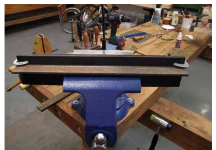
Insert the vice/plate assembly into the jaw extenders, joint your toothline...